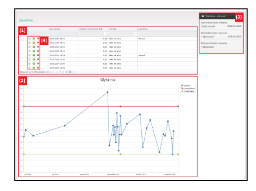
Figure 4. PMU web interface displaying development of blood glucose

effectiveness of diet adherence. Measurements of blood pressure were done by Fora P30 Bluetooth meter. Physical activity together with blood glucose levels, medication and nutrition habits are the four main elements that influence personal diabetes management. Patient's mobile provides built in accelerometer for quantification of activity level from predefined types of different exercises and sports. To assess the overall wellbeing patient can enter status of four general health conditions related to mood, feelings, energy, and quality of sleep. Severity of each condition is recorded through selection of five states ranged from normal to worsened. In case values of glycaemia are out of predefined range patient will be automatically asked to enter information about overall wellbeing.