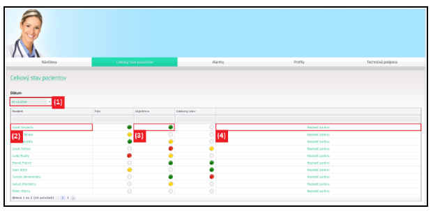
Figure 3. HPU web interface with status preview of recorded health parameters (red color indicating alarming thresholds; yellow - borderline values; green - good health conditions; white - no measurements)

Server : is used for hosting communication and analytic functionalities, security and integrity of medical data. Communication between mobile terminals and web applications use HTTPS protocol and transferred electronic data are encrypted through AES. Web and database servers are hosted on separate virtual servers. All stored data are anonymised, patients are represented through predefined codes. Mapping codes to real patients is known only to healthcare providers and is not stored in the system. Mobile data privacy is secured through SQLCipher that encrypts local database.