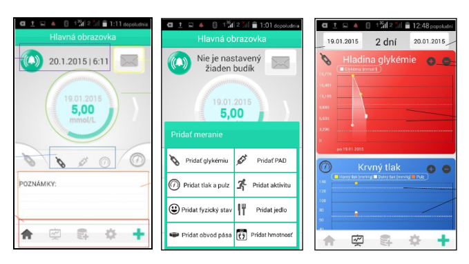
Figure 2. Mobile phone displaying the main screen with basic information and options, measurements and data entry menu, and graphical historic trends

Patient monitoring unit (PMU) : patient devices with mobile and web applications are used for obtaining the physiological data from sensors, recording parameters related to self-management of disease, receiving messages from healthcare personnel on therapy adjustments, receiving reminders, alarms and reviewing development of health in tabular form and graphical historic trends (Fig. 2).