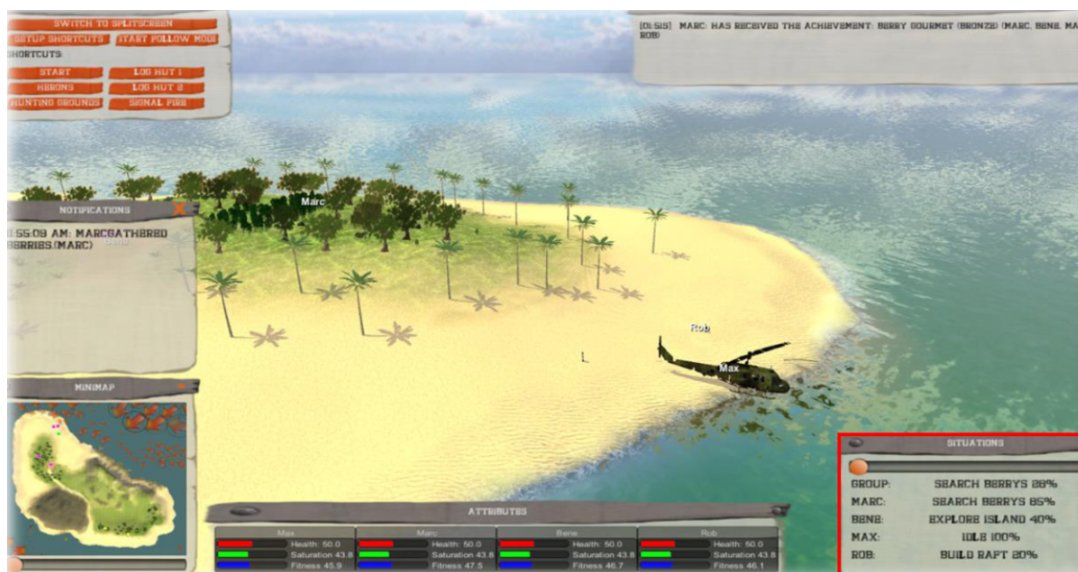
Figure 2. Game Master overview over the game including the situation recognition

situation recognition was always able to recognize the same situation for the group within 1-5 seconds of the actual situation happening. Moreover, the recognition ratio (the percentage of time the situation is recognized while it is active) is \geq 48\% for all situations, with recognition ratios of \geq 90\% depending on the situation. For single players, the correct situation was always among the three most significant evaluated situations. After that, in a second game run, with the same Game Master and a new set of four players, the visualization of the situation was enabled. Now, GMs again observed the game. After the game run, the GMs gave feedback on the situations which the situation recognition had proposed. All of the GMs stated that the situation they thought to be present was among the first three situations recognized for a player, and among the first two situations for the group.