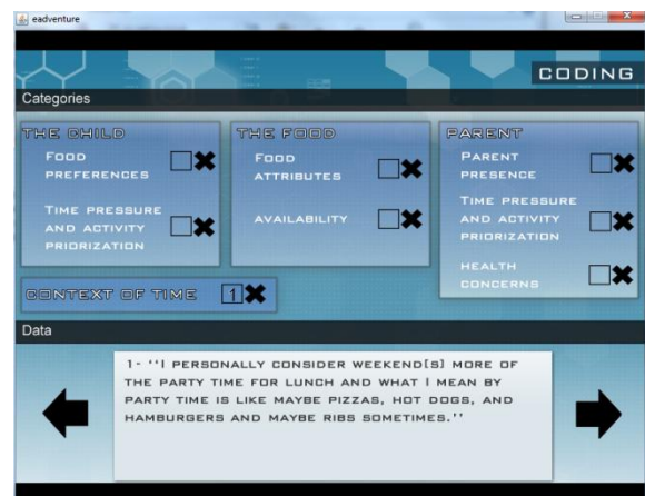
Figure 4. An example of the data and categories for the coding activity.

The qualitative coding exercise is a key activity with respect to qualitative analysis. In this activity players are provided with participants’ verbal statements about a specific topic (food preferences) and a number of pre-defined categories and the goal for the players is to classify the statements according to the appropriate higher level categories. Figure 4 shows an example of the data (“I personally consider weekend(s) more of the party time for lunch and what I mean by party time is like maybe pizzas, hot dogs, and hamburgers and maybe ribs sometimes”) and the higher level categories (the child, the food, parent, and context of time) to which players have to assign data. Players are given eight data items to code and are given feedback about the correctness of their responses.