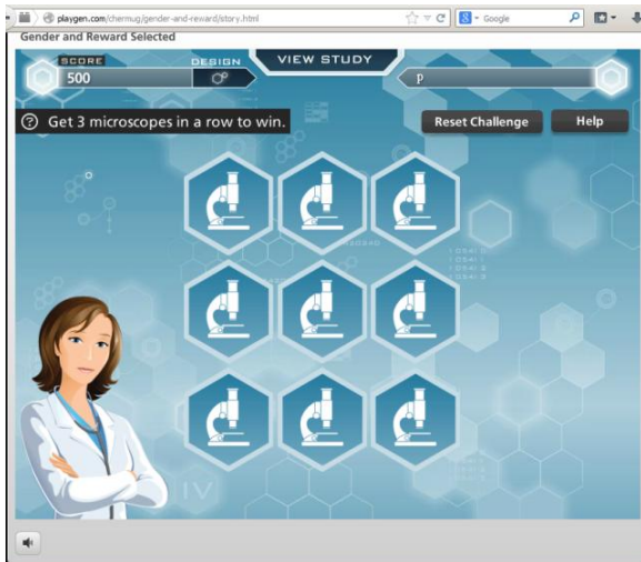
Figure 2. An example of the tic-tac-toe game mechanics.