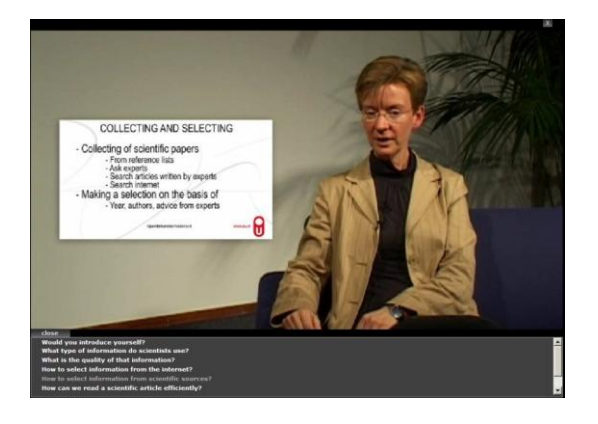
Figure 3. Senior researcher (NPC) at the virtual company while giving feedback to a task. The feedback is given in video.

Tasks and feedback are given via company-mail, or via video (see Figure 3). Feedback can consist of completed examples and discussion. Students need to compare their own solution to these as such tasks don't have unequivocal solutions. Then, based on examples, a consecutive task will be given. In other tasks, feedback is given in a very natural way (for example, reactions from NPC's when consulted during task execution).