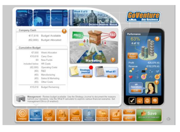
Figure 4: The Any Business' main control panel

the simulation, creating scenarios that can range from very simple to very complex/difficult; The Simulation Manager is also able to model specific events or situations to target specific learning goals