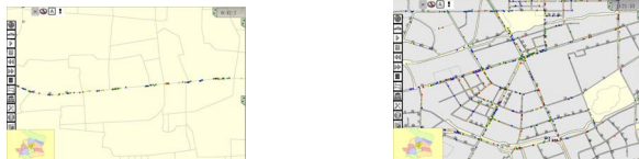
Fig.1(a)NO. 312 National Road (b)simulation of Wujiaochang

The results of simulation show two factors affect the fraction of connectivity: the density of vehicles \lambda and the transmission radius. The results in Fig.3(a) show that full connectivity may occur in