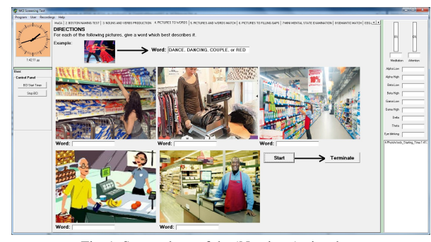
Fig. 1. Screenshoot of the 'Naming Actions' test

To test our hypotheses, the first test of a defined language bank, called 'Naming Actions' uses images as 'vehicles', to depict people performing everyday actions. Participants have to name these tasks, without time limits or help provided during the test. One single example was given prior the subtest to familiarize participants with task demands.