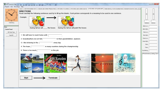
Fig. 2. Screenshoot of the 'Pictures to Sentences' test

This novel subtest, which involves matching words with the proper semantically related category, examines the difficulty to recognize the semantic distance between groups of words to create a free number of categories by them. Participants in this test try to match similar words and create groups ( Fig 3 ). The number of word-groups is not predefined and can change during the test. Reaction time was considered as a potentially critical parameter correlating with semantic deficits appearance.