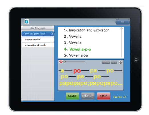
Figure 4. Vocalization exercises.

These exercises can be performed at school or at home with the parents' or teachers' help and support. The exercises are very simple to perform and do not require specific therapeutic knowledge. However, time is required for the child in order to rehabilitate the voice's timbre.