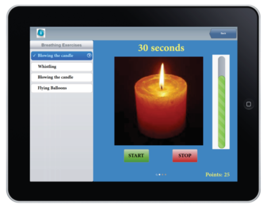
Figure 2. Blowing the candle application.

Respiratory exercises: Figure 2 shows the ways the children can improve their respiratory exercises and learn to breathe and increase their lung capacity through games. They are required to blow out the candle while breathing, in other words, providing a constant flow of air from the lungs to the iPad's sensors. A microphone detects the intensity and the airflow through the generated sound. The application offers different types of games for this treatment as seen on the right.