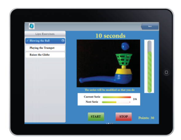
Figure 3. Blowing the ball.

As seen in Figure 4, the child can perform the exercises by following the pronunciations shown in the application, for example, a karaoke. Thus, he/she makes the interruptions and the phonemes' prolongations. Pre-visualization of the exercise content is available. In addition, exercise repetitions and examples exist to show the student how to do the pronunciations.