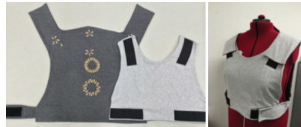
Figure 3. Prototype of smart rehabilitation garment.

The garment, as shown in Figure 3, is designed in “front” and “back” parts for ensuring the accurate sensor position and measurement. Based on the adjustable design on shoulder and wrists, the garment can fit multiple sizes of people and keeps the sensors close to users' body and at the right location.