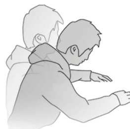
Figure 1. Example of compensation movement.

Paralleling the advances in wearable application in rehabilitation, also provides great superiority for the development of upper-extremity rehabilitation, a number of SRG's aiming at support arm-hand training have been developed [7], [8]. Although wearable technology shows great 'promise and provides many