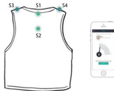
Figure 2. System overview.