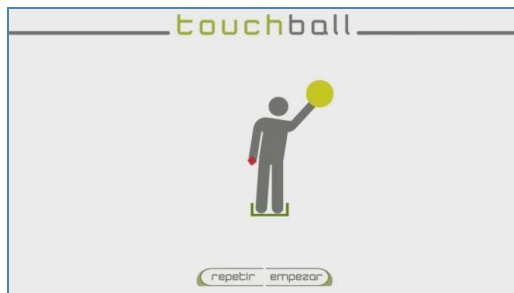
Fig. 5. Images explanatory about the interaction with the virtual environment.