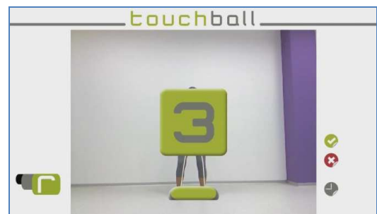
Fig. 7. The countdown before the execution of the virtual environment