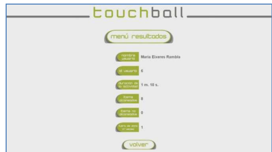
Fig. 8. The results obtained after the execution of the virtual environment.