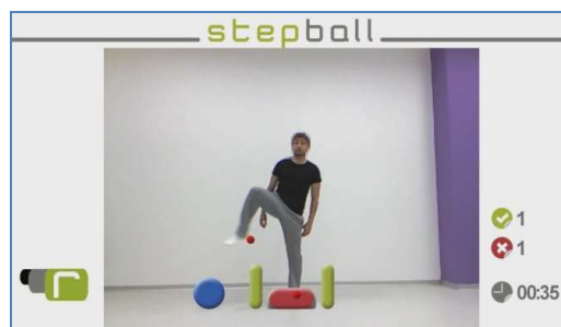
Fig. 3. StepBall virtual environment

Objective: to work in the patient the balance and weight transfer, in order to perform lateral movements with monopodal load.