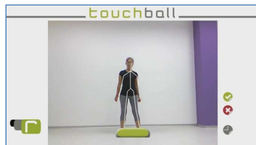
Fig. 6. The detection of the skeleton of the patient in the virtual environment.