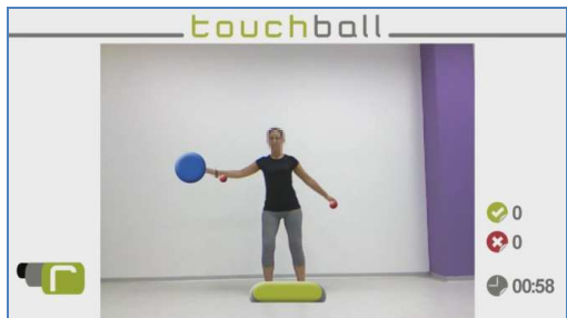
Fig. 1. TouchBall virtual environment

Objective: to work on the balance and weight transfer of the patient, to perform lateral movements of the trunk. Both issues are essential in order to achieve an improvement in gait and, in this way, to perform a right walk.