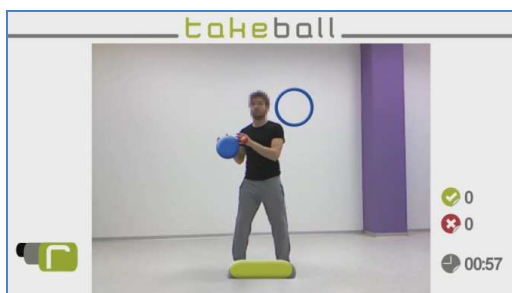
Fig. 2. TakeBall virtual environment

Objective: to work in the patient the Diagonals of Kabat MMSS , very important in neurological rehabilitation, because they work in complete movements of the upper limbs, requiring only good coordination for its implementation.