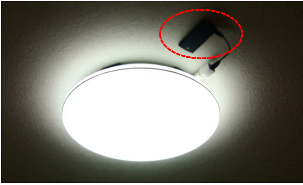
Fig. 1. Our prototype device that is attached to a ceiling light.

as Microsoft SenseCam [2], [4], [3]. On the other hand, our device focuses only on meal events and installed in an environment of interest (ceiling light).