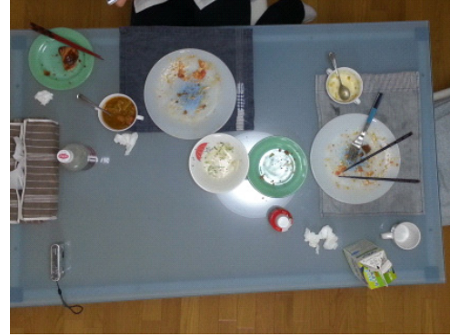
Fig. 2. Example images captured by our device.

and find an image with the highest complexity value. When an image includes many foods, the image also includes many edges. So, we compute the complexity value based on detected edges. The complexity of an image p is defined as follows [7].