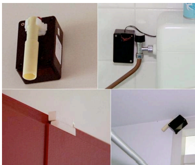
Figure 1. Sensors installed in the homes of the elderly participants