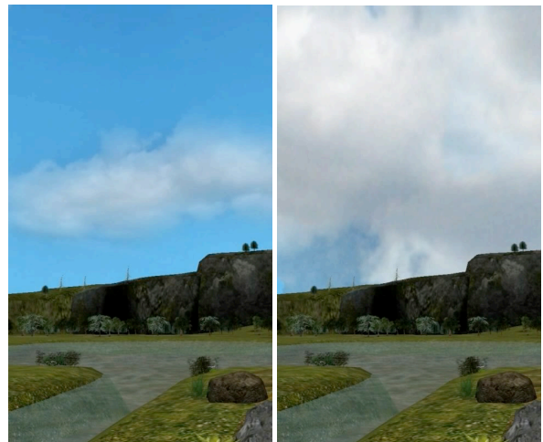
Figure 3. Biofeedback environment

During the clinical sessions, the therapists may suggest the patient to perform a number of special relaxation exercises before the next session. The patient may easily access this "homework" via the appropriate button in the main screen of the application. Upon click, the application opens the patient's interface of the patient management system, and the user can review his/her assignments and check those which have been done. In the next clinical session, the therapist reviews the progress of the homework. By correlating exercise time with the stress level history the therapist can analyze which exercises were most effective against the stress and, if necessary, adjust the treatment accordingly.