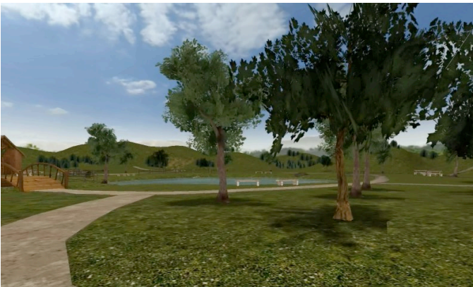
Figure 2. Virtual reality relaxing environment

This exercise allows the patient to relax by immersing into a calm and peaceful virtual reality environment. The walk through the environment can be accompanied either with soft music or a relaxing narrative designed by professional therapists. For better effect, the patient is free to choose between seven different environments, from beach or forest to campfire or mountain hiking (see Fig. 2).