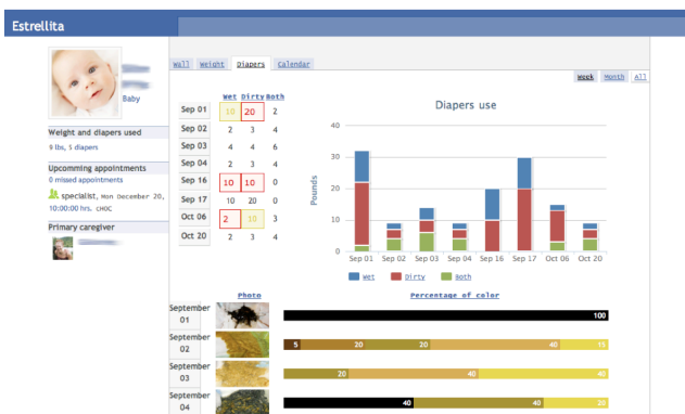
Figure 2. A screenshot of the Estrellita web portal, primarily designed for clinicians and other healthcare professionals. This particular page shows details about an infant's diaper count, a graph of past diaper counts, and several system-generated color histograms for problematic diapers.