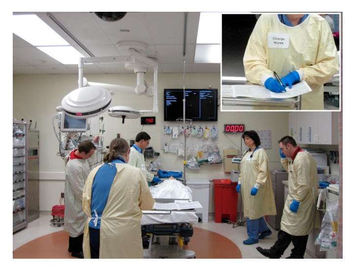
Figure 3: Simulation setting, arrangement of trauma team members, digital pen in use (upper right corner) and the TraumaPen display. Second display (not shown) is mounted on the wall opposite to the first display.

process by using the digital pen and by watching a 10-minute video of a real trauma simulation, and, (c) discussion about nurses' experiences. The nurses were seated at the desk, with the TraumaPen display positioned in front of them and simulation video projected on the wall on their right-hand side. During the recording activity, we observed nurses' interactions with the pen and whether they were looking at the display. The current design of the flowsheet was not altered for the study. The only modification was overlaying the Anoto dot-pattern on the document. Each session was audiotaped and transcribed. We again used the open coding technique to identify major themes about the system's use and its impact on nurses' work.