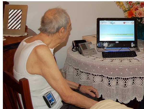
Figure 2. Example of the home monitoring system (from [18])

Among the research activities, we have also developed a novel textile-based monitoring system (MagIC) [17], for acquisition and storage of physiological signals (ECG, respiration, and motion) recorded in patients at home or during outdoor activities, and for their remote transmission.