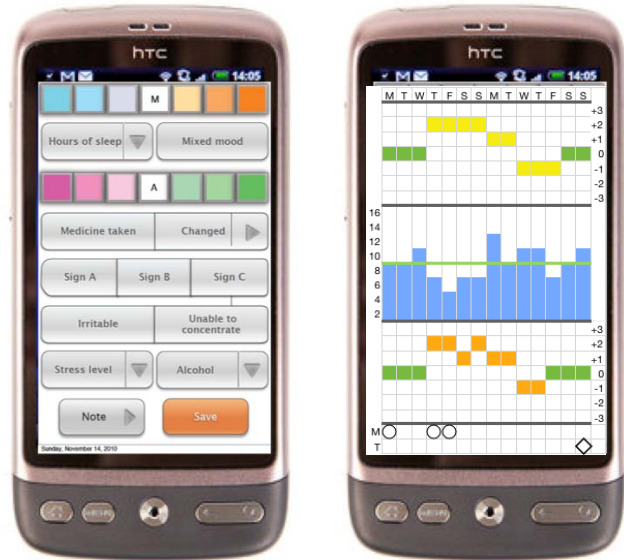
Figure 2. The MONARCA application on an Android phone. Left: The self-assessment form. Right: A graph showing data collected over two weeks on mood, sleep, activity, and medication.

We think that this is an important insight into the design of persuasive technologies for mental illness and self-management. Many of the technologies and metaphors reported so far deal with personal life-style related health management, which is fundamentally different from patients with a mental illness. Thus, we used a variant of the metaphor strategy to provide feedback to the patient that would be more sensitive to their illness – a trigger and coaching system, which is described in the next section as one of the goals of our system design.