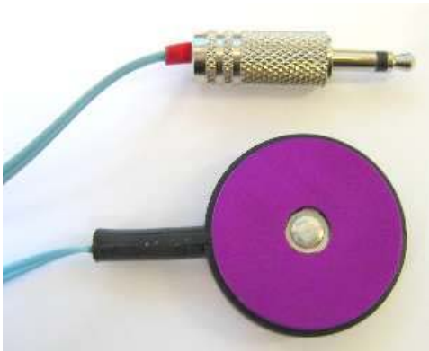
Figure 2: Engineering Acoustics C2 Tactor ( www.eaiinfo.com )

Brewster and Brown developed the concept of Tactons (tactile icons) [7] which have been used successfully in mobile devices. Tactons [7] are structured vibrotactile messages which can be used to communicate information non-visually. They are the tactile equivalent of audio Earcons and visual icons, and could be used for communication in situations where vision is overloaded, restricted, or unavailable, such as navigation systems for blind people, or in mobile/wearable computers [7]. An example of the hardware being used is the Engineering Acoustics C2 Tactor which can be seen in Figure 2.