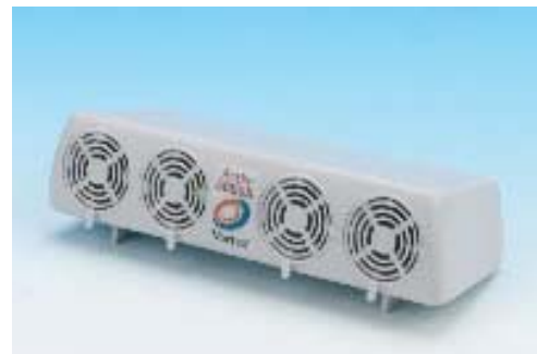
Figure 4: Dale Air Vortex Olfactory Display ( www.daleair.com )

The potential of smell as a notification medium has been somewhat overlooked. In everyday life our sense of smell (olfaction) is often used to grab our attention when we cannot necessarily see something (the smell of freshly brewed coffee for example). Smell also has strong links to memory and emotion [e.g. 4, 5]. These properties of smell could be exploited in the home context for message delivery where users may have multiple sensory impairments and/or memory decline. Smell-based technology (such as that shown in Figure 4) is however often dismissed as impractical (despite plug in and controllable air fresheners becoming more commonplace in houses and cars). These technologies can allow software to trigger a fan to dissipate an aroma (or several aromas) into the environment.