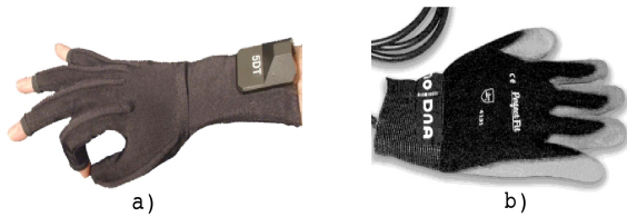
Fig. 1. a) 5DT dataglove; b) X-IST dataglove HR1

are attached onto the top of it. The inner layer is covered with an outer glove which protects the sensors and associated electronics from the outer environment. There is a choice of two outer layer versions: a rubber coated or a lycra / elasthan version which is thinner and more stretchable than the rubber version [7]. Each bend sensor has a flexure resolution of 10 bits and a sampling range of 100-200 Hz dependent on filter settings.