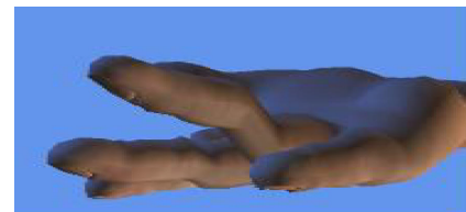
Fig. 3. Animated hand using sensor data from glove

A 3D hand model has been created using the 3D Max application as shown in Figure 3. Sensor data harvested from the data glove enables an accurate animated sequence of hand movements to be displayed in 3D.