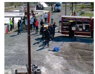
(b) Emergency Scenery Video - 29.7 dB (33.88 fps @ 226 kbps)

Fig. 1. Adaptive HEVC encoding framework example. In this example, we have adaptation for the maximum video quality mode subject to real-time encoding that translates to frame-rate \geq 25 fps and available bandwidths of [3]: (1) BW \leq 250 kbps to (2) BW \leq 384 kbps (max 3G upload speed). For the lower bandwidth, we achieve a maximum PSNR of 29.7 dB (33.88 fps @ 226 kbps) while the second bandwidth gives a maximum of 31.9 dB (29.29 fps @ 363.53 kbps). Encoding delay was 0.426 seconds with 6 core Xeon@2.26 GHz (WPP streams / pool / frames: 18 / 6 / 2 for x.265 encoding).