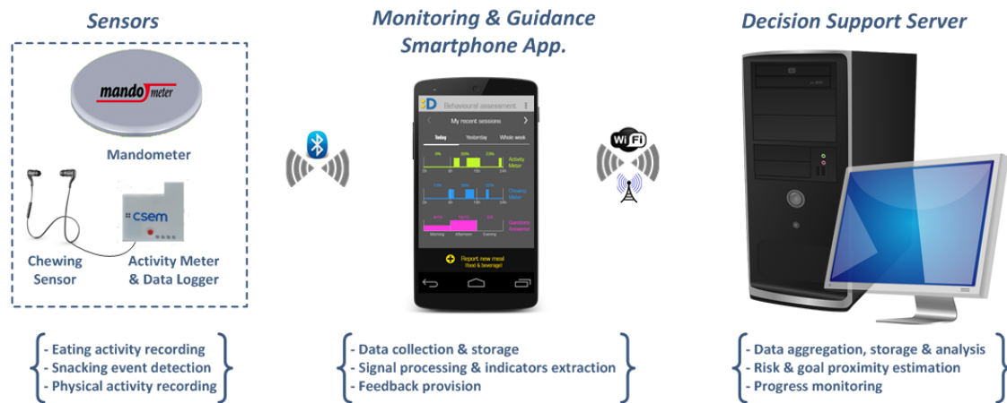
Fig. 2. High-level architecture of the SPLENDID system.

to the computational efficiency in order to allow – if possible – the execution of some of these algorithms on the Smartphone or even on the micro-controllers of the employed sensors.