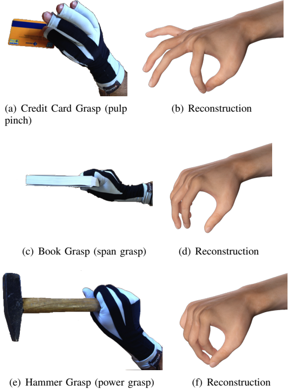
Fig. 3: Comparison between real and reconstructed postures from the dataset described in [11].

To improve the hand pose reconstruction, we used postural synergy information embedded in the a priori grasp set, which is obtained by collecting, a large number N of grasp postures x_i , consisting of n DoFs, into a matrix X \in \mathbb{R}^{n \times N} . The grasp postures were collected by using a highly accurate optical tracking system (Phase Space, San Leandro, CA - USA) and were executed by a right-handed healthy male subject (age 26), different from the one who performed the experiments reported in this work. This information can be summarized in a covariance matrix P_o \in \mathbb{R}^{n \times n} , which is a symmetric matrix computed as P_o = \frac{(X - \bar{x})(X - \bar{x})^T}{N-1} , where \bar{x} is a matrix n \times N whose