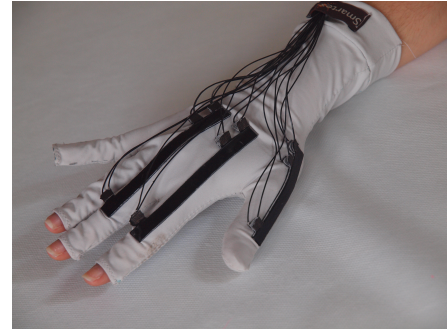
Fig. 2: The sensing glove endowed with three KPF goniometers placed on thumb, index and medium fingers.

previously employed as single layer strain sensors for measuring local fabric deformations due to joint movements [14], [15] or respiration activity [16]. In [6] authors evaluated KPF textile goniometer technology applied to the sensing glove in comparison with a gold standard instrument (Smart DX 100 produced by BTS Bioengineering [17]). The angular errors were in the order of few degrees [6].