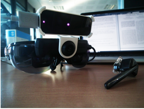
Fig. 2. Leap Motion Controller, Vuzix AR Glasses and Plantronics Headset

dictionary. Although in some cases convenient, continuous speech recognition has the drawback of generating a lot of false positive detections in noisy environments. As a solution, the present paper proposes to tie it to a specific gesture, in order to de/activate it at will. The interface features a few, key vocal commands, in order not to force the user to remember too many words and to improve the recognition rate. Moreover, the commands are context-dependent, in order to minimize the number of false positives .