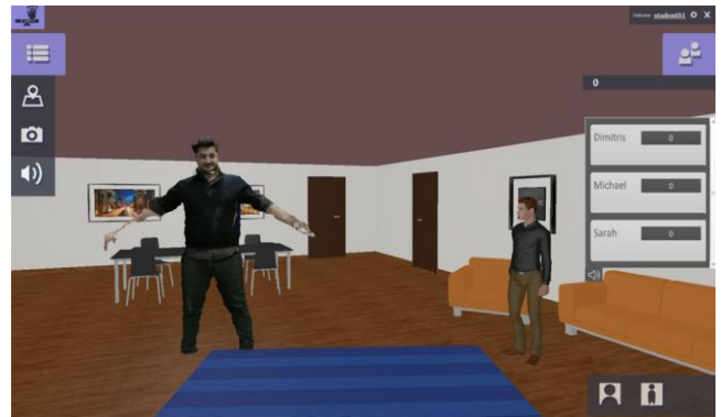
Figure 2. REVERIE Hangout UI: account information on the upper-right corner, user viewpoint on the lower-right corner, main functionalities menu and gestural functionalities selection icon on the upper-left corner.

Simplicity is achieved by reducing the number of menus. Three menus are always visible for actions requiring instant access. The menu in the upper-right corner provides access to account information, access to change system parameters and an icon to close the application. The placement of these menu options is also consistent with many web-based applications. The main menu and participants list can be hidden when not needed to increase the screen space, since user interaction usually takes place in the central area of the screen. The participant’s list uses a Module Tabs design pattern [27]. It is divided into tabs to make it easier to access