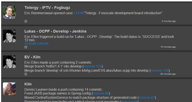
Figure 2. Cropped version of the detailed event list

The information items depicted in table IV are reflected in Iris as follows. Firstly, the issues originate from an issue