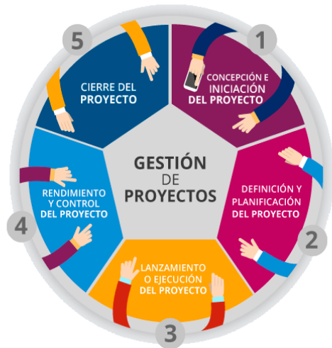
Figure 2. Project management

Another concept of vital importance lies in the information systems development process. This process becomes relevant because projects are established as responses to the objectives pursued by the organization. In each project, with precision and specific goals, information systems emerge that are designed with the fundamental purpose of addressing challenges or facilitating the fulfillment of the delineated scopes. These systems act as strategic tools, helping to solve problems and playing an instrumental role in achieving the objectives set for each project.