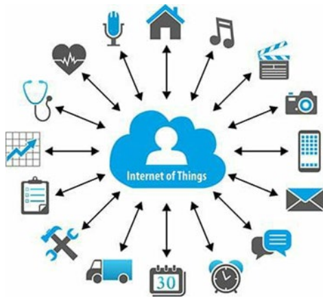
Figure 1. IoT Devices

devices are used in a variety of industries as [7][8][9][10][11]: