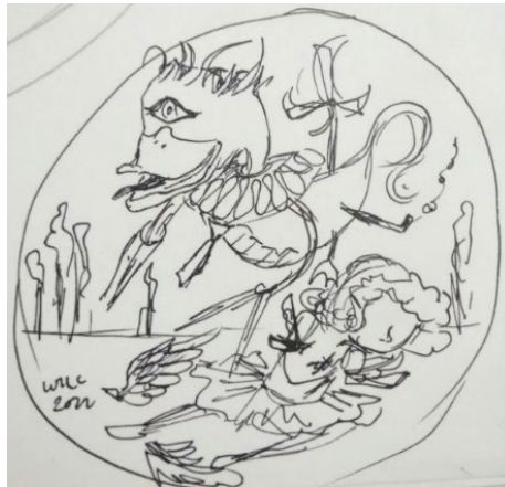
Fig. 2. Rough sketch.