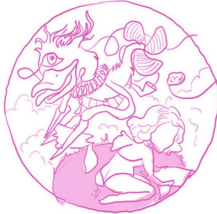
Fig. 3. Final sketch.

The rough sketch was made in A4 paper with HB pencil and then bolded using a black pen. This sketch is not final yet, and there is potential for it to be changed again to get the perfect final sketch.