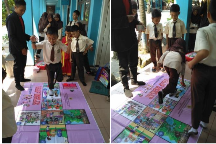
Figure 1. Students do Traditional Games Of Engklek

This research is in line with the results of research by Andriani that traditional games can shape the character for children[2]. Apriani explained that the results of the application of traditional games on the crucial could improve children's motor skills[10]. The results of the application of traditional engklek games can improve children's motor skills and build children's character through these traditional children's games [11].