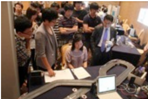
Figure 1. BCI Game using Brain Information as Healthcare Design Outcomes: Racing Car Game with BCI : designed by Bio-Computing laboratory at GIST, Korea, EPOC and Carrera Slot Car