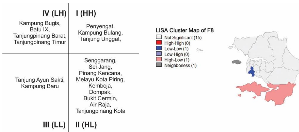
Figure 3. Moran's Scatter Plot (left) and LISA Cluster Map (Right) for B8 Behavior