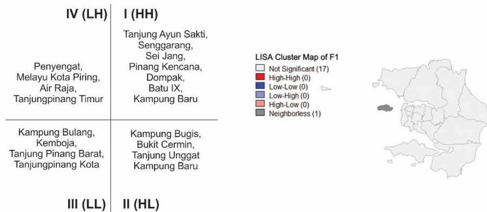
Figure 2. Moran's Scatter Plot (left) and LISA Cluster Map (Right) for B1 Behavior

Figures 2 and 3 show the LISA analysis of B1 and B8, respectively. It could be seen from Figure 2 that six kelurahan located in high-high quadrant (I (HH)), 4 in high low quadrant (II (HL)), 4 in low-low quadrant (III (LL)), and 4 in low-high quadrant (IV (LH)). However, there are no significant spatial association of kelurahan for all quadrants of B1. On the other hand, Figure 3 shows that there are significant associations of B8 in HL quadrant which centered in Dompok and in LL quadrant which is pointed in Kampung Baru.