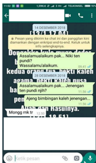
Fig. 2. Use of WhatsApp Text Messages by Students to Lecturers

Figure 1 above is one example of using WhatsApp Messenger done by students to lecturers at inappropriate times. In the picture, a student starts a chat at 05.16 WIB. It was still too early to start chatting about the campus. In the figure, the students also did not initiate the chat using greetings. This needs to be avoided and considered by students because not all lecturers always keep their student contact numbers.