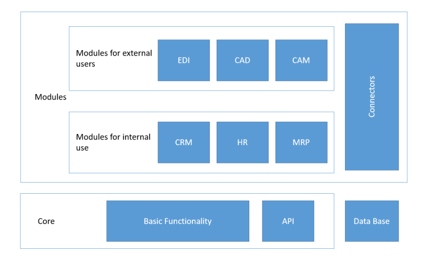
Fig. 2. Structure of the ERP system

The scheme of interests of ERP systems is shown in figure 2.