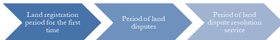
Fig 1. The Periodization of Maladministration in Settling Land Disputes