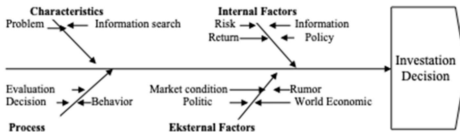
Fig 5. Fishbone Diagram

The study was conducted at Unimed using questionnaire sheets filled out by investors or potential investors. Types and sources of data used are primary and secondary data. This type of research is quantitative research. The research flowchart illustrates what will be done on the fishbone diagram below: