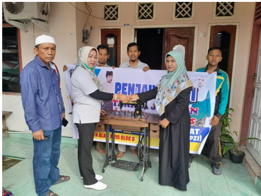
Figure 2. Distribution of PT IKPP Zakat Zakat Sewing Machine Assistance

The collection of company and plantation zakat by the Riau Province National Zakat Agency has been carried out optimally, but the results have not been significant. Even though many plantation and forestry companies operating in Riau Province have potential human resources and financial resources that need to be empowered. These companies certainly have a lot of human resources, such as PT Indak Kiat as the largest paper provider company in Southeast Asia/internationally which has 8,000 employees but the zakat collected only reaches IDR 50-60 million per year.