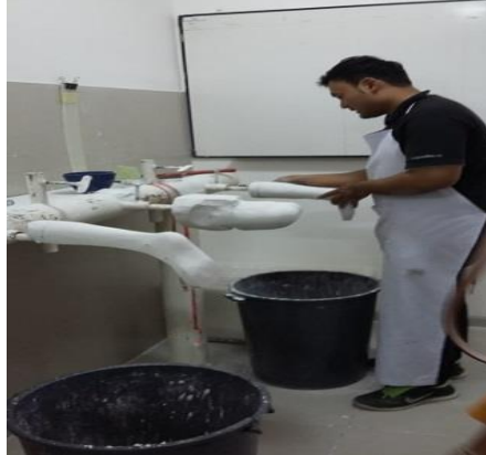
Figure 2. Fake leg process by the expert