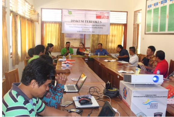
Figure 3. Academic Script Arrangement

Figure 3 into one of the evidence that in designing an academic manuscript, Puspadi Bali discussion theory. Figure 3 is a discussion conducted by Puspadi Bali in the Regency of Buleleng in 2016. It also showed that in designing the academic texts into a local regulations require a long time to be able to produce regulations that can answer the needs of persons with disability. It not only takes a long time to do some discussion, to produce a law that can answer the needs of the disabled, disability, Puspadi Bali undertook to invite persons with disability in the discussion of the matter. clearly visible in Figure 11 above.