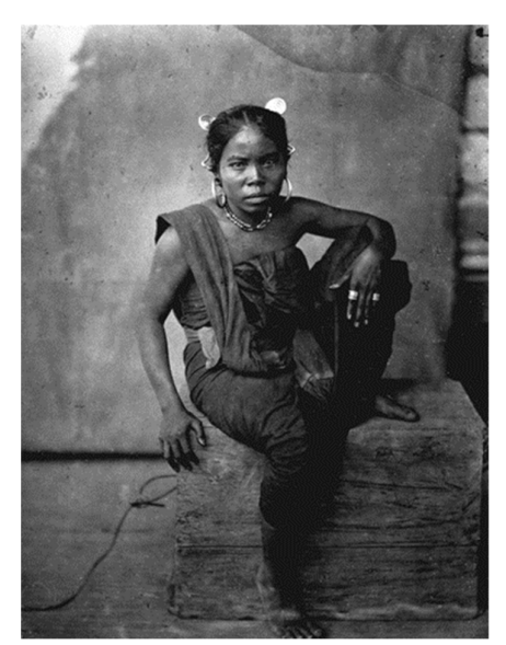
Fig. 1. Portrait of a Karo Batak woman

This photo shows the figure of a young woman as the subject. As the title suggests, the woman in the photo is from the Karo ethnic group. The dark-skinned young woman wears a cloth covering her body from chest to calf and drapes a shawl over one shoulder. The interesting part is the woman's sitting position, which is lifting one leg on the wooden box she sits on with one arm resting on her knee. This position is uncommon for Eastern women, since it is usually performed by men. This woman's eyes look sharp into the camera. Some jewelleries appeared to be worn are two types of earrings, a necklace, and several rings on the index and little fingers of her left hand. This photo was taken in a studio (or it could be a home interior), which is marked with a canvas screen as the background. Judging from the dark impression on the right side of the face and other body parts, the photographer uses the light source from the left side of the subject. This can also be seen at the feet of the subject which shows the shadow clearly. One of the characteristics of Feilberg's photography is that it produces very sharp photos. In addition, another characteristic is a distance between the subject and the blurred background [6]. These characteristics can be seen in this photo, sharpness in the subject and blurring effect in the background.