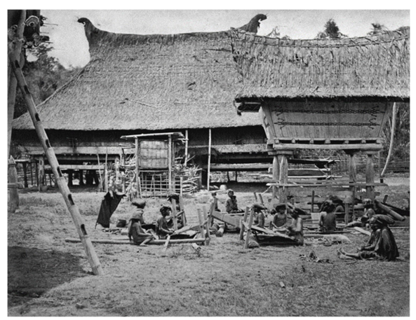
Fig. 3. Village view with Karo Batak women behind weaving machines

While Kristen Feilberg's two previous photos focused on a subject with a blurred background, in the following photo both the subject and the background appear balanced. This photo records the activities of several Karo women with various age group, ranging from children, adults, and the elderly. These women weave cloth (uis) in their yard. Some of them are seen holding babies or cradling children, some are seen conversing. Almost all of the women in the photo are wearing a headscarf or cloth covering the head (tudung) and wrapped around the chest to the bottom. But there are some women who leave the chest exposed. Besides tudung, they also wear padung-padung jewelry. The head covering, or hood commonly worn by Karo women is called uis batu jala. This cloth is black in colour and on the right and left edges there is a white colour with a decorative motif of a goat or repeated curved lines. According to Sitepu [8], the main material for making uis is kembayat, cotton from local residents' plantations which then spun into yarn. The materials used for colouring are ash water, lime, turmeric and telep, a type of plant called sarap. The photo shows a simple loom, called a pemapan, made of bamboo and wood, which serve as a place for hanging threads and separating the top and bottom threads.