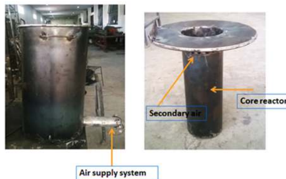
Fig. 2. The stoves prototype