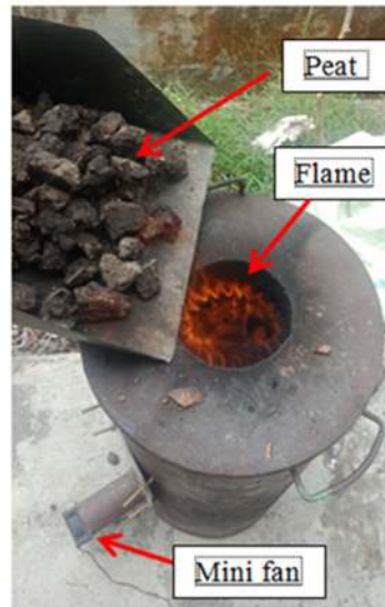
Fig. 3. The stove flame photographic in operation

It was found that the peat with moderate diameter size (about 3 cm) was achieved higher flame temperature about 680 °C with ER was about 0,34 during peak hour of the test run and then decrease. In this condition, the ability of the peat can also be observed through the colour of flame shown. This result is confirmed by the previous research through wood gasification in downdraft gasifier attain the higher Carbon monoxide and Methane content in the syngas on ER about 0,36[23].