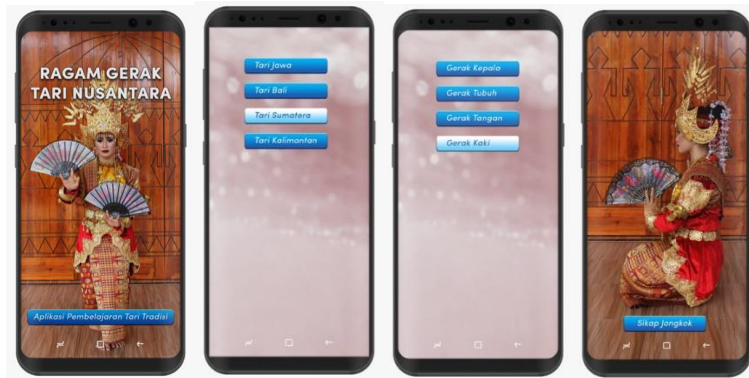
Figure 2. Design of Android-based dance learning application

In Figure 2, the appearance of an Android-based dance learning application, started with the face or cover displaying with the title of the material to be studied, then there is a button that must be pressed that will then display the next slide. There are several choices, namely dance from various regions, and when pressed one of the dances the next page will display gestures then choose which parts to learn. Simple design of Android-based traditional dance motion learning media, then it will be developed.