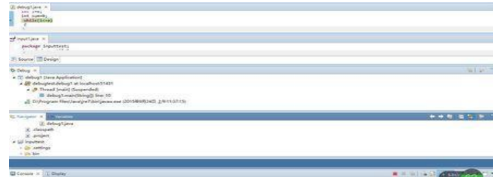
Fig. 1. My Eclipse interface diagram

can be said that MYECLIPSE is almost all of the current mainstream open source products, the exclusive ECLIPSE development tool.