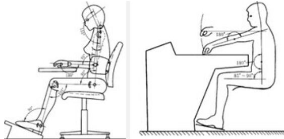
Fig. 1. Man-machine engineering example