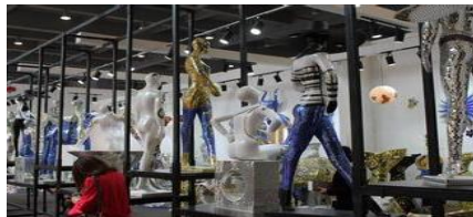
Fig. 2. Examples of art display design

User experience of interactive media interface to cope on ever use of functional operation of skilled, function of the unused can combined with experience and independent thinking and use, so that users we call user experience or expert users. They are often able to find the meaning of the interface of the deep information, with a high level of information classification and comprehensive ability. In the face of the experience of the user's interactive media interface style design, should try to meet the needs of users, to give users a free space to play. The ultimate goal of the design is to design for the person, not the product, this is the first principle of design. Therefore, in the design must fully consider the human factor. Ergonomics is the "human factor" as an important condition to consider. Ergonomics is ergonomics a important research direction, to the interactive media interface design fully consider the "human factor" provides the structure of the human body scale, human physiological and psychological scale data, the reliable data can effectively use of interactive media interface design to [3].