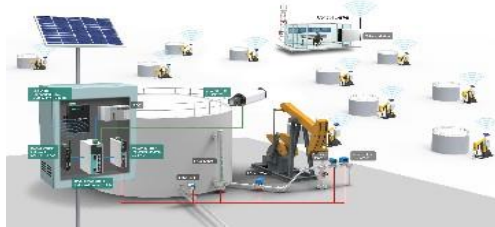
Fig. 1. System function structure diagram