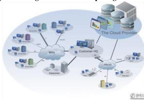
Fig. 2. Schematic diagram of key technologies of cloud computing

Network service platform based on cloud computing, play in the storage process are mainly rely on the form is distributed, confidence in a large number of data were multiple measures of protection, to improve the reliability of the system, to protect the security of data, will be more convenient services to users. Is the current cloud computing concept degree of perfection and related technology development status, Hadoop distributed file system and scalable distributed file system (Google GFS) discovery is a cloud platform used in the core technology of a storage area, in order to meet the large demand for cloud computing to the university sports educational administration teaching platform based on building management system to transfer application performance strong, large amount of service units of storage technology. GFS, distributed file system is the current two key cloud storage technology, which provides a basis for the study of cloud computing related Internet companies [3].