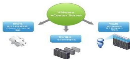
Fig. 3. Sketch map of virtualization technology

which can improve the quality of network service. Depending on the resources of the computer set pattern can be virtual technology into polymerization, split into two categories, play a role in security network software and hardware resources independent of that cloud computing in the crack patterns of virtualization technology mainly refers to is further division of resources, the single resource into a plurality of resources of small units, but also in the real environment of different network resources integration [4].