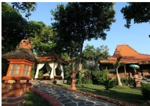
Figure 4. Shanti Natural View Hotel in Sambangan Village