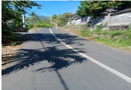
Figure 3. Main Street of Sambangan Village