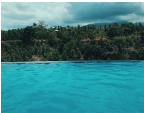
Figure 2. Sambangan Nature Tourist

The supporting attraction in Sambangan Village such as Krisna Adventure and Alam Sambangan where these tourists objects take advantage of main attractions such as the natural beauty in Sambangan Village. In the Krisna Adventure tour, there will be some game sensations, namely paintball, flying fox, and ATV. Fling Fox game where tourists will slide from a height coupled with views of green rice fields. ATV games are carried out by passing through muddy rice fields. The distinctive rural scenery in the Krisna Adventure area makes this location a photo spot for tourists. In Nature tourism, Sambangan offers swimming pool facilities that are outside the room and also facilities in the form of selfie spots with a background in the form of a hilly area. Besides, in Sambangan Village there is an artificial tour that has just opened, namely the Palawan Hydroponics tour with a tourist attraction including hydroponic houses and wooden houses known as Hobbit houses. Also, in this tour, there is a culinary tour at one of the stalls that use three concepts, which are directly picked, processed immediately, and eaten immediately.