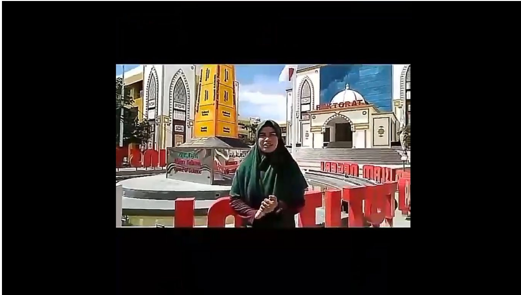
Figure 2. Google Classroom Based Learning Media to Increase Social Concern in the Covid Pandemic Period 19

The application of goggle classroom in the pandemic Covid -19 period which was designed through audio visual based learning media that connects the internet world with the theme: various learning media that are packaged in the results of the YouTube learning design, in the process of making YouTube activities students apply physical distancing that is by how to make YouTube learning content in groups but still following the covid-19 protocol, keep your distance and avoid the crowd. The results of the video design were presented in class using the goggle classroom application. Thus, students have a sympathetic ability to the social environment during the 19th pandemic as an effort to prevent the spread of Covid-19.