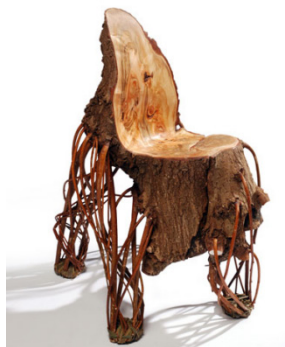
Figure 2. Original Furniture