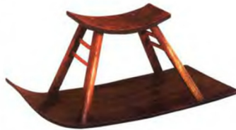
Figure 5. Rice-planting bench

The idea of "human-centered design" has gradually penetrated into all aspects, human-centered design is to "people" as the main design, requiring designers to design reflects the care for people, give full consideration to people's physiological needs and psychological needs. Folk furniture's human-centered design thinking is also reflected in its compliance with the needs of various conditions of use. Taking the sitting furniture which is most closely connected with human production and life as an example, its complicated and diversified products are the best illustration, only the types of stools are bench, high stool, crescent stool, half-round stool, matzah, seating pier, bar stool, pillow stool, juicing stool, rice-planting stool (Figure5.), shaving stool (Figure 6.), drawer stool (Figure 7.), and so on.