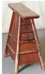
Figure 6. Shaving bench