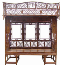
Figure 4. Jiangxi Bamboo Frame Bed

Scandinavian furniture and Southeast Asian furniture as an example, they follow the principle of locally sourced materials in the selection of materials, designers use the wood with its color, texture and natural texture into furniture design. Because of living in northern hemisphere's high latitude, the long term living in cold areas, Scandinavia people use some good insulation properties in the construction of the house wood, so the local designers are fond of wood, they