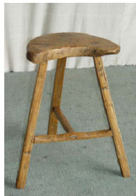
Figure 9. Crescent Moon Stool