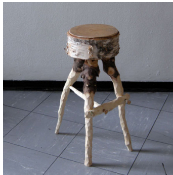
Figure 1. Original Furniture