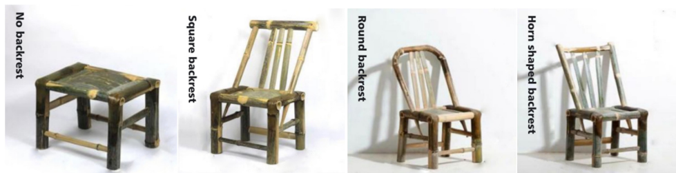
Figure 10. Chairs with Different Backrests

There can also reflect the principle of function to the top of the bed is toggle bed. The uniqueness of the Batten bed is that it forms a small enclosed gallery in front of the bed. On both sides of the gallery, various utensils and items such as small tables, benches, and blue washing utensils can be placed for daily use. The wooden toilet in the gallery allows you to use the toilet without getting out of the bed, which is a good solution to the problem of going to the toilet at night while sleeping. It is very convenient to set up a dresser in the gallery so that you can get up directly in the morning to freshen up [7] . The richness and accuracy of the function of the toggle bed furniture brings imaginable convenience to the people's home life (Figure11).