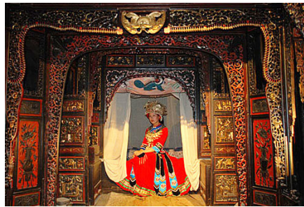
Figure 3. Tujia Drip Bed

Folk furniture is mostly made and used by ordinary people, which can directly reflect the local economy, culture, geography, etc. Regional furniture is developed through the long-term accumulation of various aspects, as a kind of furniture form popular among local residents, it contains the essence of the local culture, permeated with the feelings of the local people. The so-called regionality refers to the design to absorb the local, national, folk style and the cultural traces left by the history of the region. Regionality is to some extent ethnicity is more narrow or exclusive, and has a strong recognizability. As the saying goes, "Ten miles of different winds, a hundred miles of different customs." The vast expanse of China, due to the differences in terrain, landforms, climate and the uniqueness of the local customs of the more than fifty ethnic groups in China, forming a rich and colorful national folklore phenomena as well as the unique personality of different regions of the furniture orientation (Figure3.). In the northern region, due to the cold weather, every family has a kang bed, and people eat, chat, meet guests, do their daily work and sleep on the kang, forming a kang-centered life style. As a result, local folk furniture includes kang-centered kang tables, low cabinets and other furniture series. The southern regions of Jiangxi and Zhejiang are rich in bamboo and rattan resources, thus producing a large number of bamboo and rattan furniture (Figure 4.).