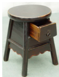
Figure 7. Drawer stool