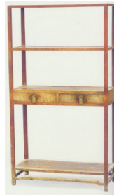
Figure 8. Three-compartment Shelf

processing technology and material loss. The moderate design of furniture calls for people to get out of the past aesthetic ideas of luxury and visual enjoyment, and to establish a moderate and sustainable design aesthetic to realize the harmony and common development of people and the environment (Figure8., Figure 9).