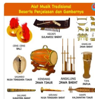
Fig. 2. Tools traditional music