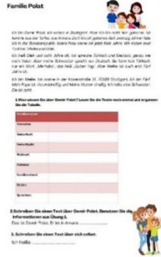
Fig.5. Theme 4