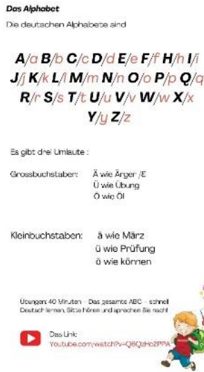
Fig.4. Theme 1