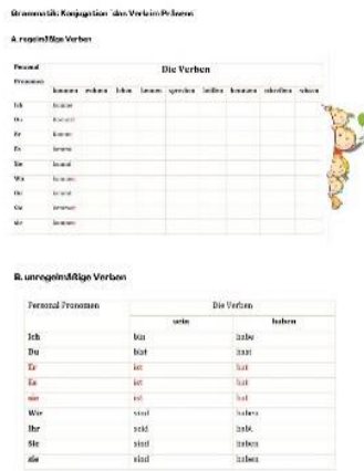
Fig.6. Übung (Practice)