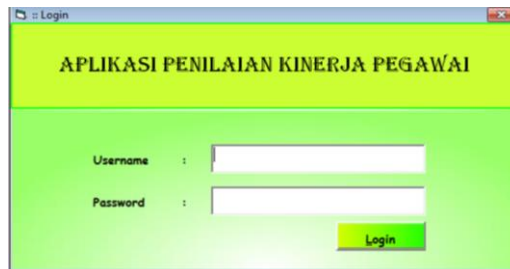
Fig. 2. Login Form of admin and employee assessor

When the performance assessment application icon is activated, it will appear login form and then the user is asked to input the username and password to login into the program. If user and password are input correctly then the system will give the permission. Otherwise, if the user and password are wrong, system will refuse and provide information that the user that is input is wrong. Therefore the existence of login form and other computer security are very important to protect data from irresponsible parties[14].