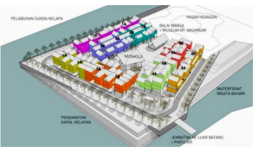
Fig. 11. The Latest Concept of Maritime Tourism Kampung for Kampung Akuarium in September 2019 (Source: Design Andesha Hermintomo and Bardha Gemilang)