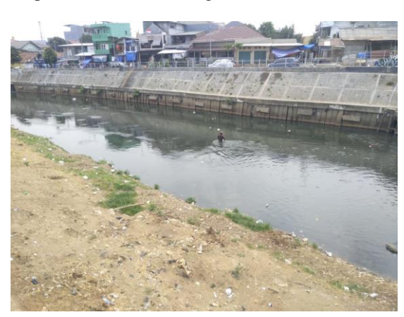
Fig. 2. The Ciliwung River is shallow enough for a person able to stand.

But it's a fact that after eviction there is (almost) no flood at all in the Kampung Pulo , which is according to interviewees kinda make other areas envy them. The Kampung Pulo dweller whose didn't evicted also able to park their vehicle in the inspection track (figure. 3). They had to park their car far elsewhere before. Although the area that didn't got evicted is still "slum", hence encourage as a birthplace for a criminal (figure. 4).