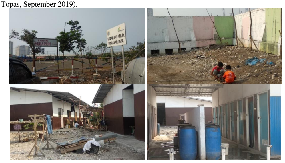
Fig. 9. Kampung Akuarium Today's in 2019

Provincial Government after Anies-Sandi's victory the Jakarta Election in 2017 (Interview with