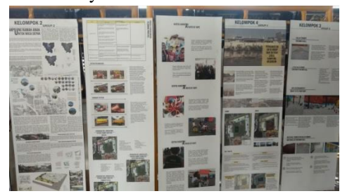
Fig. 10. The "This is Kampung " Exhibition in International Field School at Kampung Akuarium in 2019

"This is Kampung" Exhibition, displays the design and concept of the Kampung Akuarium as a result of International Field School activities. Based on its potential and history, the community was accompanied by facilitators to initiate the concept of the Maritime Tourism Kampung which was considered suitable and able to improve the welfare of the community. Through various dialogues and training, the concept of a sustainable Kampung is expected to be ready to start (built) in mid-2020 (Interview with Yani, September 2019). Through CAP, relocation and eviction proved not the only way out for the existence of Kampung which has been negatively imaged by the Government. CAP is thus an attempt to re-arrange according to the needs and expectations of the community—prioritizing to accommodate the rights, ideas and needs of the community rather than depriving the human rights of the poor who inhabit settlements that are considered illegal and slums. The Vertical Kampung Model, initiated by residents and facilitators through the CAP, is considered more humane to guarantee the lives of citizens. The design aims to preserve interaction and culture typical of Kampung and in line with the principles of inclusiveness and sustainability in the development agenda.