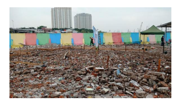
Fig. 8. Kampung Akuarium After Eviction in 2016

It cannot be denied, that residents also claim to have certificates that give them the right to occupancy that they have been occupying (Interview with Teddy and Yani, September 2019). Therefore, residents of Kampung Akuarium do not accept if they are considered to inhabit wild areas. Not only that, for residents, Kampung Akuarium is not a slum settlement as the Government considers it (Interview with Teddy, September 2019). Because of that, the people made a resistance the eviction very hard. Even so, the fact is that the physical condition of Kampung Akuarium falls into the slum category if seen at 7 indicators based on the Circular Letter of Ministry of Public Work and Housing (Kementerian PUPR) in 2016 about General Guidelines for Without Slums Program ( Program Kota Tanpa Kumuh/KOTAKU ). Even though residents resisted strongly, the eviction was inevitable.