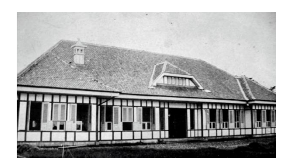
Fig. 6. Batavia Fisheries Laboratory (Visscherij Laboratorium te Batavia) in 1922