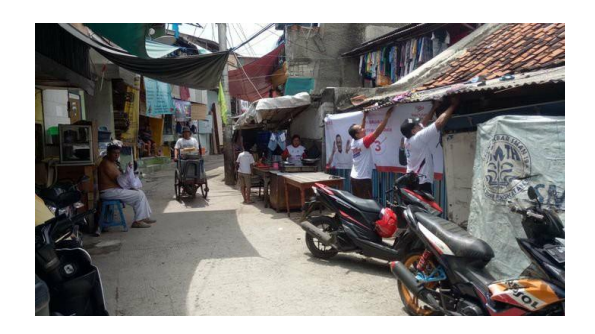
Fig. 7. Kampung Akuarium Before Evicted

It cannot be denied, that residents also claim to have certificates that give them the right to occupancy that they have been occupying (Interview with Teddy and Yani, September 2019). Therefore, residents of Kampung Akuarium do not accept if they are considered to inhabit wild areas. Not only that, for residents, Kampung Akuarium is not a slum settlement as the Government considers it (Interview with Teddy, September 2019). Because of that, the people made a resistance the eviction very hard. Even so, the fact is that the physical condition of Kampung Akuarium falls into the slum category if seen at 7 indicators based on the Circular Letter of Ministry of Public Work and Housing (Kementerian PUPR) in 2016 about General Guidelines for Without Slums Program ( Program Kota Tanpa Kumuh/KOTAKU ). Even though residents resisted strongly, the eviction was inevitable.