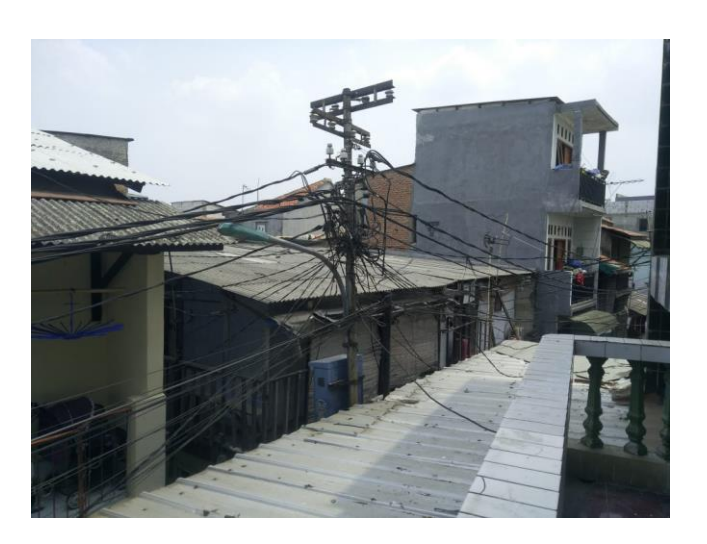
Fig. 4. Still not safety enough, vulnerable when there is fire

As it said before, that the boy will commit a crime because the "condition" allows him to do it. The objective situation is also important to provide an opportunity for a criminal act. For example, a thief may steal a cake when the owner not in the sight, but will refrain if the owner is in the sight. In Felson & Cohen's Routine Activity, the cake is the object, the owner is the guardian and the "boy" is the offender. A crime will occur when there is a suitable object, an absence of a capable guardian, and the capable offender. It also means that there is a way to prevent crime by manipulating the environment.