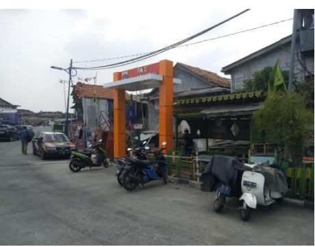
Fig. 3. Inspection Track for Vehicle Park